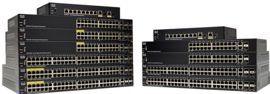
Figure 1. Cisco 250 Series Smart Switches

The Cisco 250 Series is the next generation of affordable smart switches that combine powerful network performance and reliability with a complete suite of the network features you need for a solid business network. These powerful Fast Ethernet or Gigabit Ethernet switches, with Gigabit or 10 Gigabit Ethernet uplinks, provide multiple management options, sophisticated security capabilities, fine-tuned Quality-of-Service (QoS) and Layer 3 static routing features far beyond those of an unmanaged or consumer-grade switch, at a lower cost than for fully managed switches. And with an easy-to-use web user interface, Smart Network Application, and Power over Ethernet Plus (PoE+) capability, you can deploy and configure a complete business network in minutes.