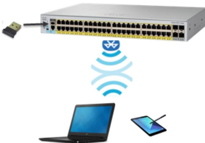
Figure 4. Over-the-air switch access using Bluetooth