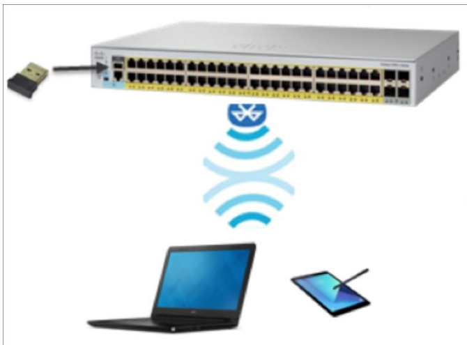
Figure 2. Over-the-air switch access using Bluetooth